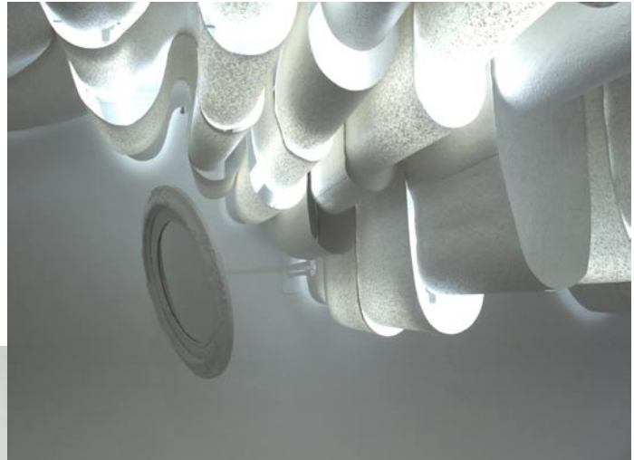
light fixture and rear view mirror