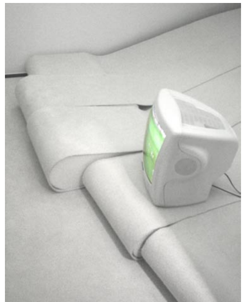
couch table with TV